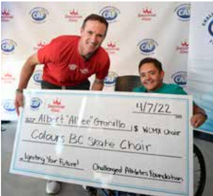
CAF + DREW BREES + SMOOTHIE KING ALBEE GRANILLO