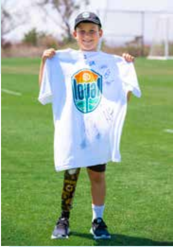
CAF + SAN DIEGO LOYAL + TOYOTA BECKETT BLACK